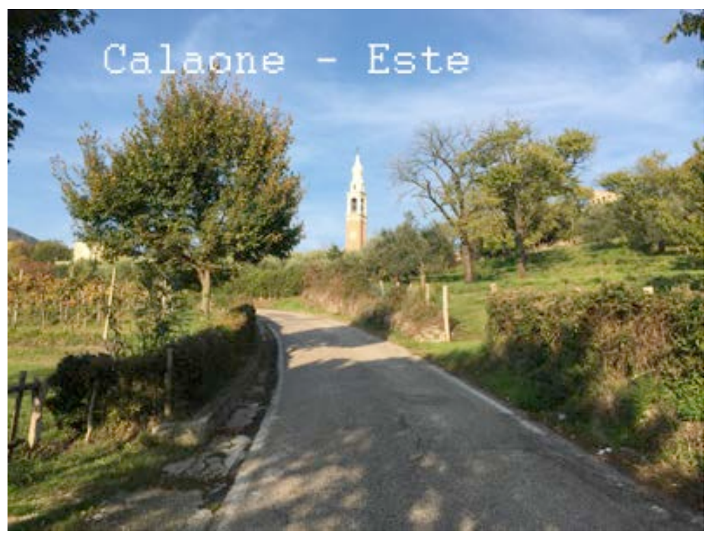
Route from Calaone - Meggiaro- Este