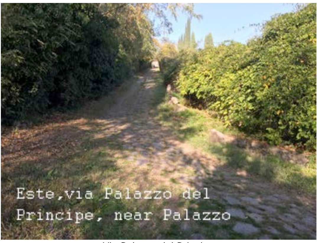
Via Palazzo del Principe