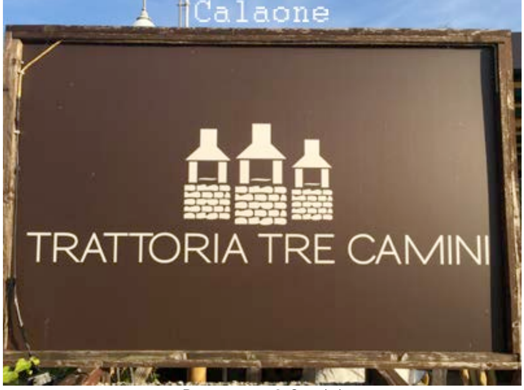
Restaurant 3 Camini

Arrived at the peak of the hill, 300 meters before Calaone, you can take a break in the restaurant 3 chimneys. The owners are good people.