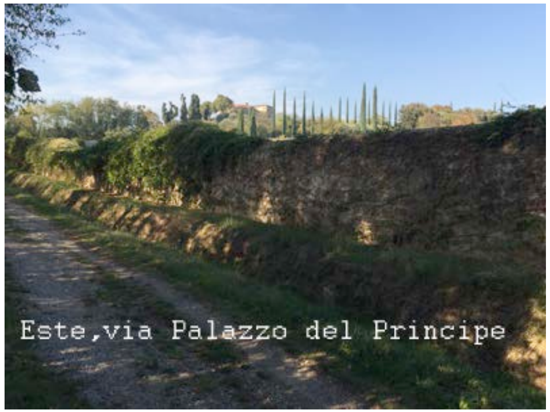
View from via Palazzo del Principe