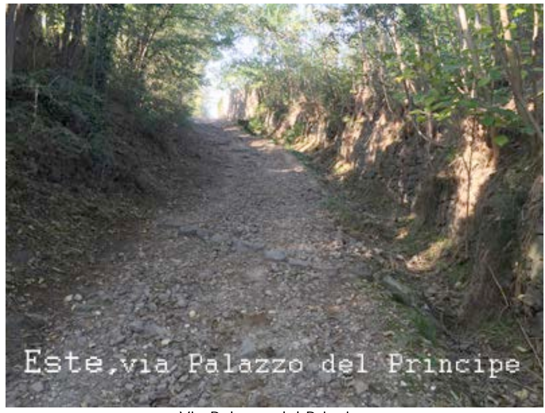
Via Palazzo del Principe

The road goes up and becomes a path where no cars pass. A nice path.