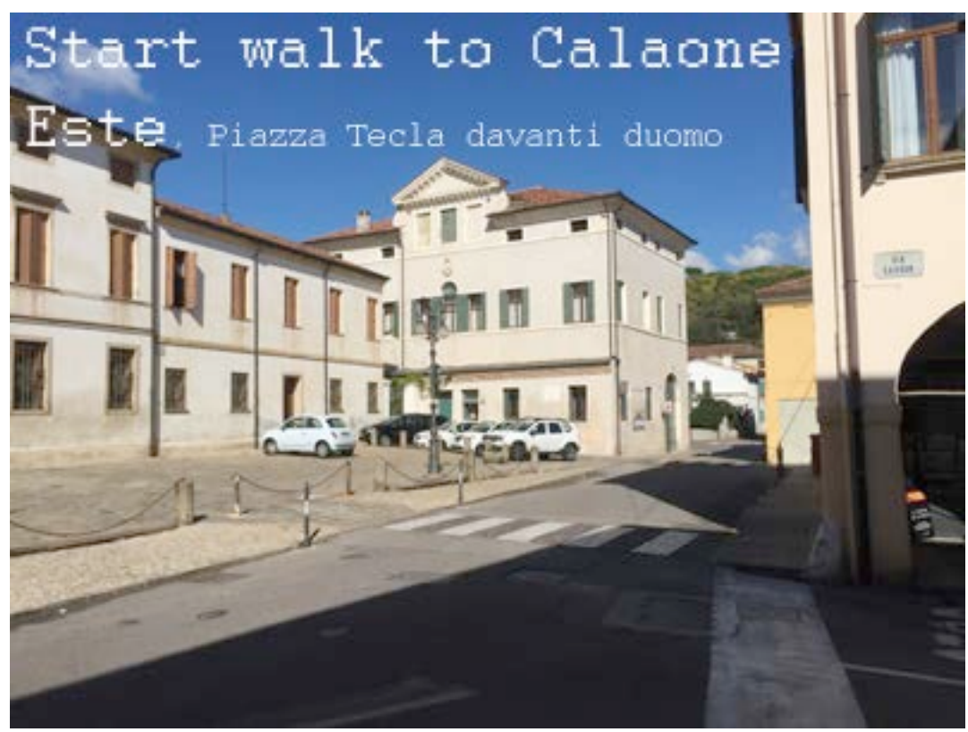
Piazza Tecla, Este