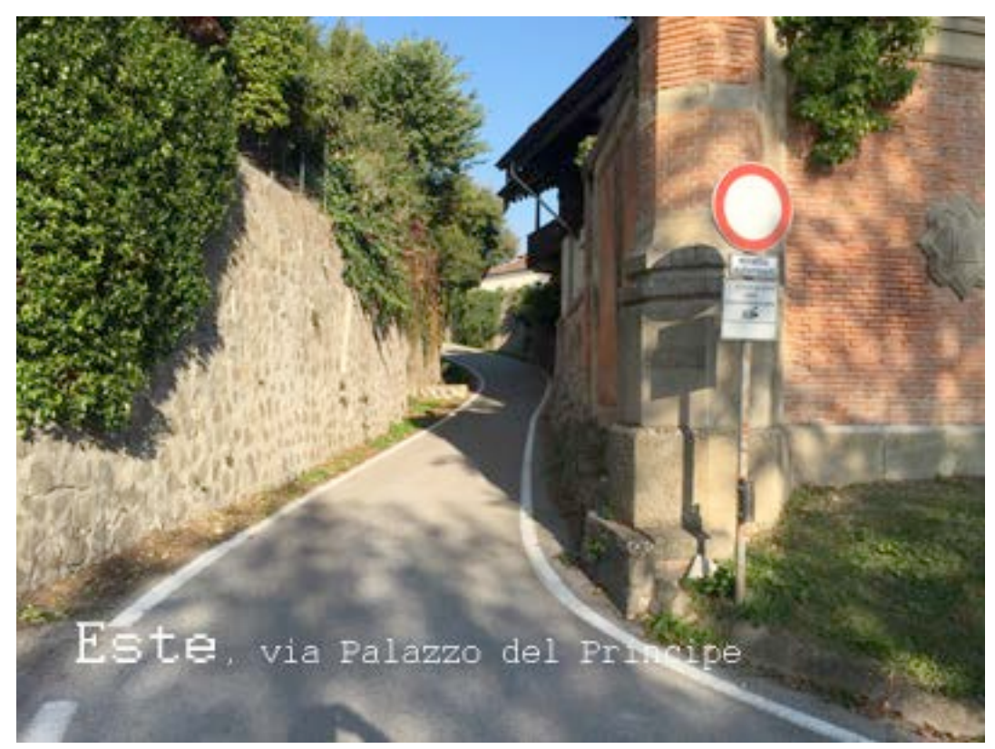
Beginning of via Palazzo del Principe

The road goes up and becomes a path where no cars pass. A nice path.