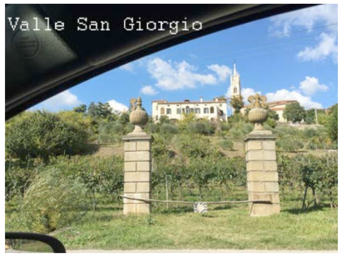
Valle San Giorgio, villa Benavides and the church

Arrived to church, go up toward the house villa Beatrice, on the mount Gemola.