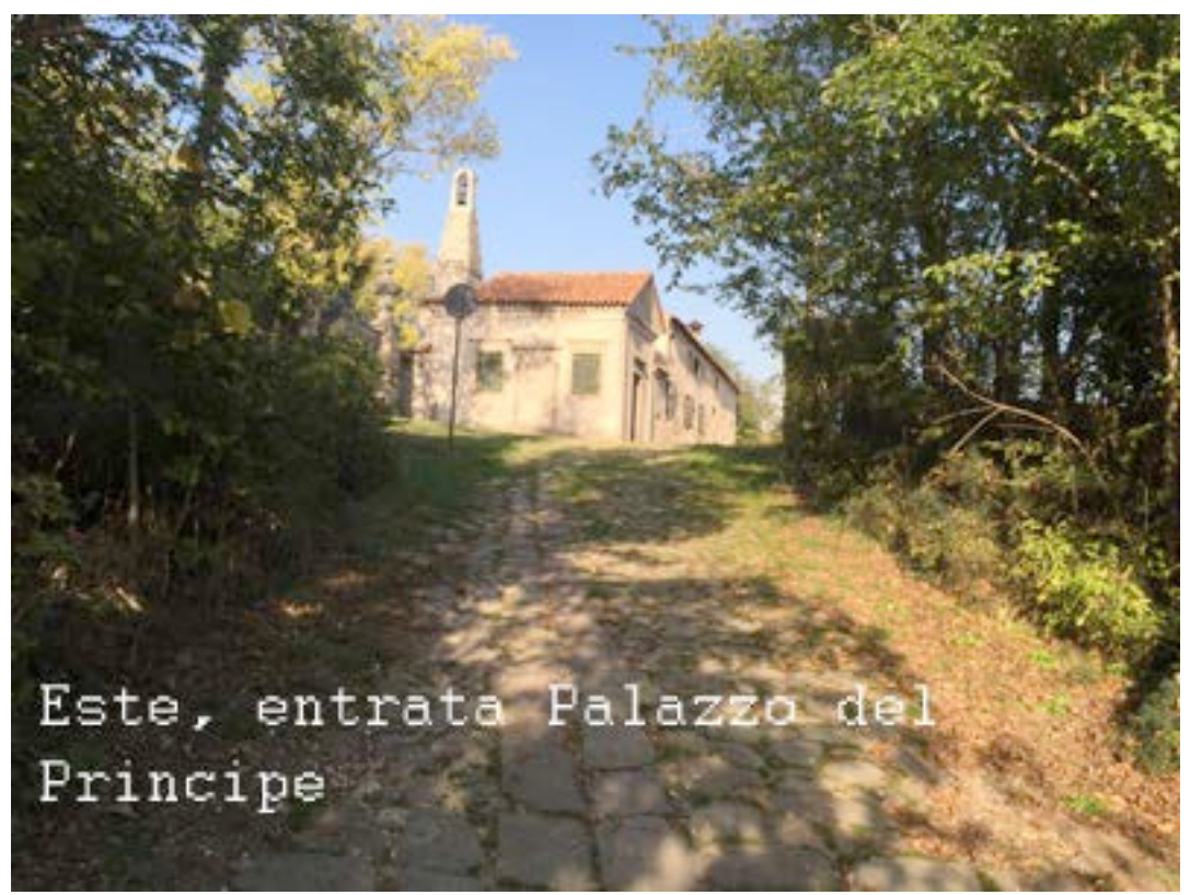
Palazzo del Principe

Continue on the same path Palazzo del Principe.