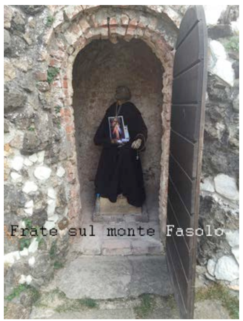
A friar on monte Fasolo

From the wine cellar Mount Fasolo continues on the same path until you get on the road to go to Arqua.