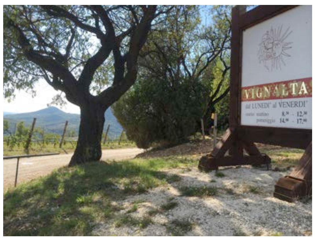
Vignalta, from monte Fasolo to Arqua

After a few miles you will arrive to Arqua Petrarca.