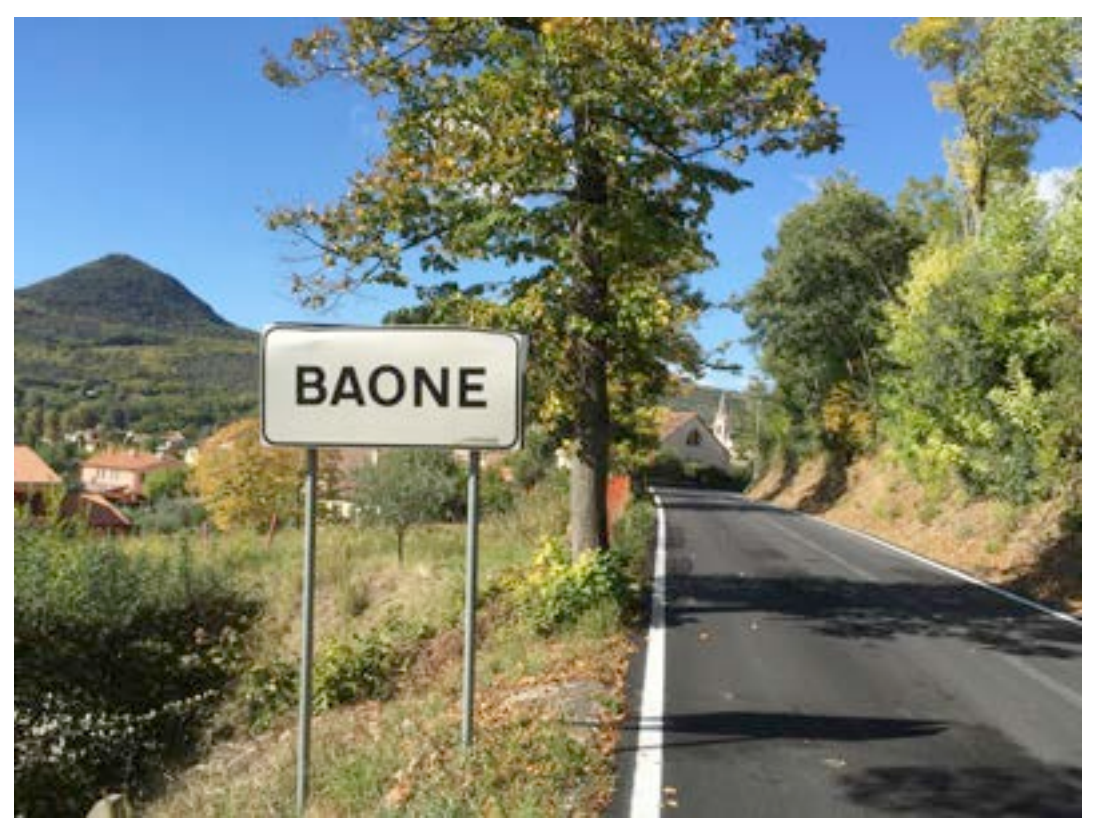
Road to Baone

From Baone continues to Este. On this road there is a traffic light, just in front of it, there is wonderful Venetian villa, villa Borin.